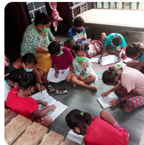
Teacher visiting a home for small group instruction