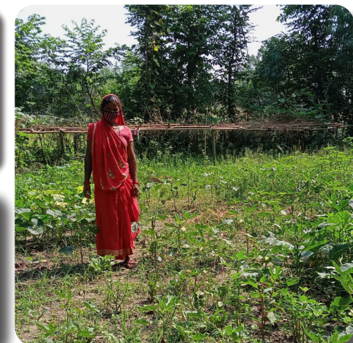
WG member showing her kitchen garden