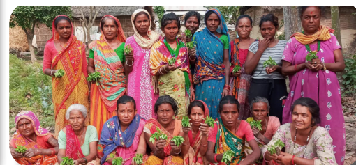
Women's group loan distribution (top); women's group receiving seedlings (bottom)