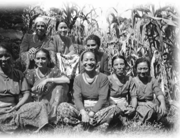
Shreejana Management Committee

"One woman can't do any of this alone, but it turns out that many women together can do it. That's what we've discovered."