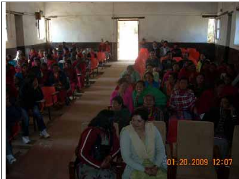
Participants of the seminar

A total of 109 persons participated in the seminar.