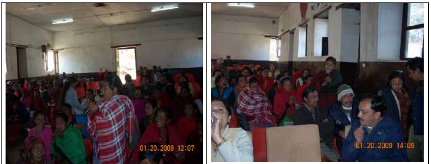
Participants asking questions and presenting their observations