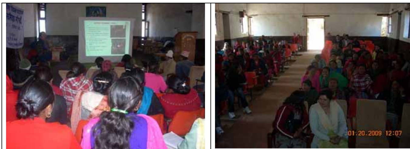
Chandi Shrestha presenting the program