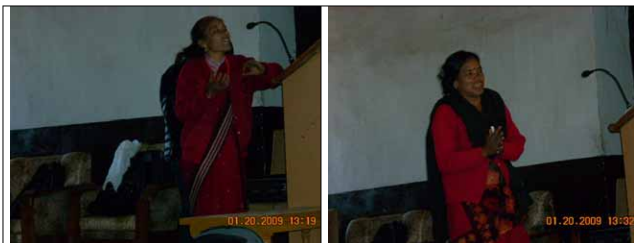
Beneficiaries presenting their experiences of working with ETC

The speakers said that ETC/FSS have worked very hard to make change in the community and the real development work has started in their place after the ICD implementation.